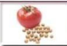
Biotechnology Regulatory Services