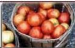
Plant Protection and Quarantine