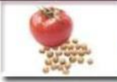
Biotechnology Regulatory Services