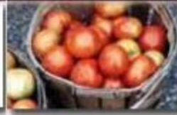
Plant Protection and Quarantine