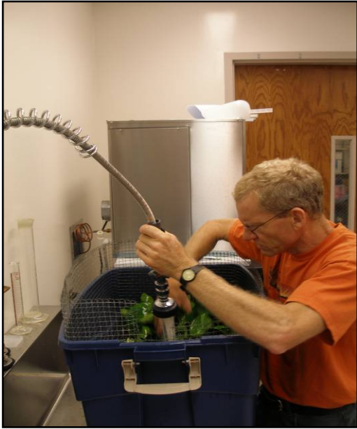
Figure 9. Rinse hose with potable water.