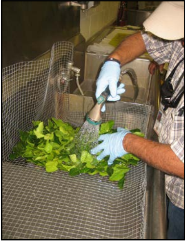
Figure 4. Rinse hose and mesh to support leaves.