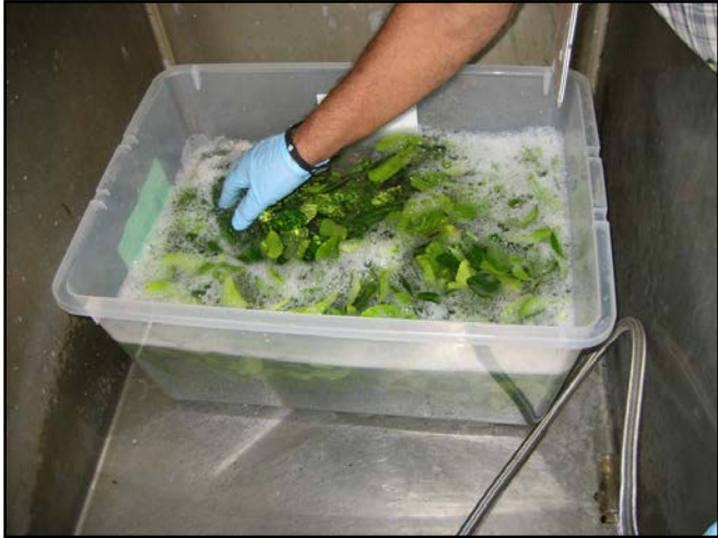
Figure 3. Leaf wash basin.