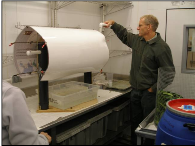
Figure 5. Raffle drum with shield to direct falling debris.