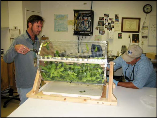
Figure 1. Raffle drum-type tumbler with catch tray.