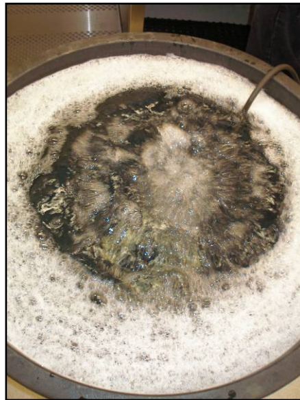
Figure 8. Wash tub with air hose to produce foaming action.