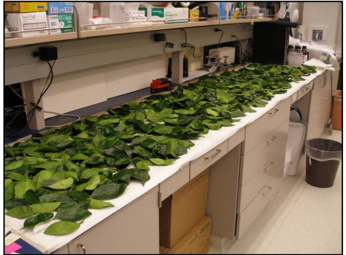
Figure 10. Leaves spread out to dry.